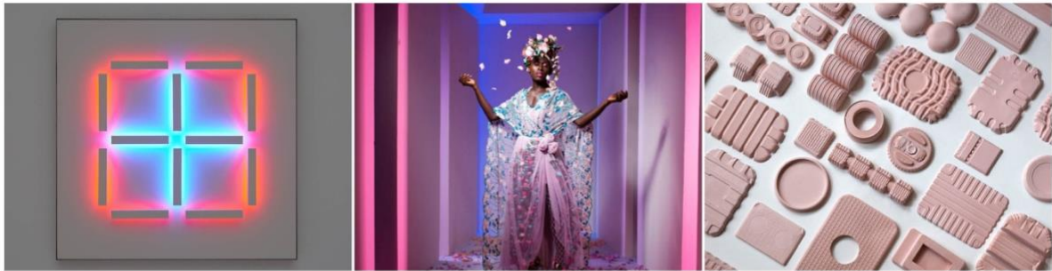
Images: 1. Erwin Redl Reflections, LEDs, custom electronics, MDF panel, stainless steel frame, 91.4 x 91.4 x 10.2 cm. 2. Carlos David, Personae II, Ink-Jet print on Hahnemühle Photo Rag Metallic Video in 4K. 3. Henny Burnett, 365 Days of Plastic, cast dental plaster.

This year's shortlisted artists deal with today's most prescient themes, from algorithm bias and data dissemination to the effects of the climate emergency.