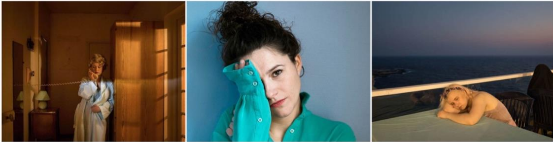
Images: 1. FRANCE. Neuilly-Plaisance. September 4, 2018. From the series Agata . 2. Bieke Depoorter. 3. Bieke Depoorter, Untitled (Agata, Lebanon, Beirut, August 3, 2018) .

Bieke Depoorter joins Aesthetica for a unique masterclass at the Future Now Symposium, focused on authenticity and ownership in 21 st century photography.